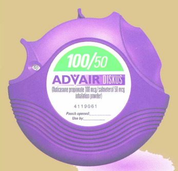
Advair Diskus® fluticasone propionate/ salmeterol inhalation powder