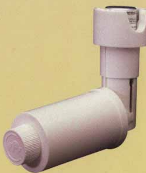
Azmacort® triamcinolone acetonide