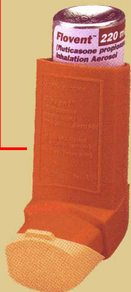
Flovent® fluticasone propionate