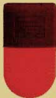
Flovent Rotadisc® fluticasone propionate inhalation powder