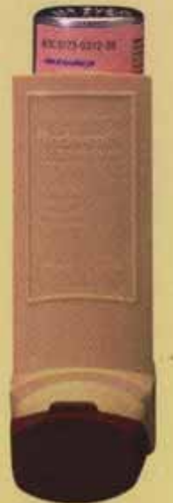
Beclovent® beclomethasone dipropionate, USP