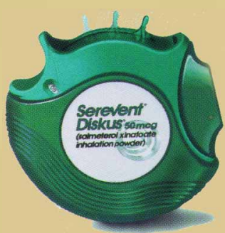
Serevent Diskus® salmeterol xinafoate inhalation powder