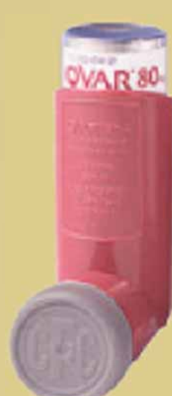
QVAR® beclomethasone dipropionate HFA