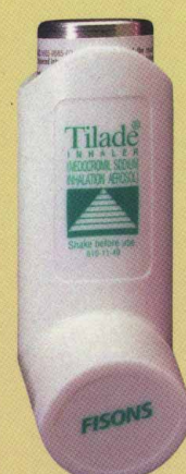
Tilade® nedocromil sodium