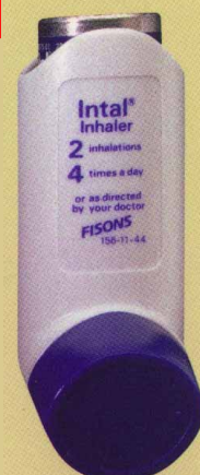
Intal® cromolyn sodium