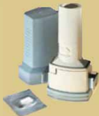
Foradil® Aerolizer™ formoterol fumarate inhalation powder